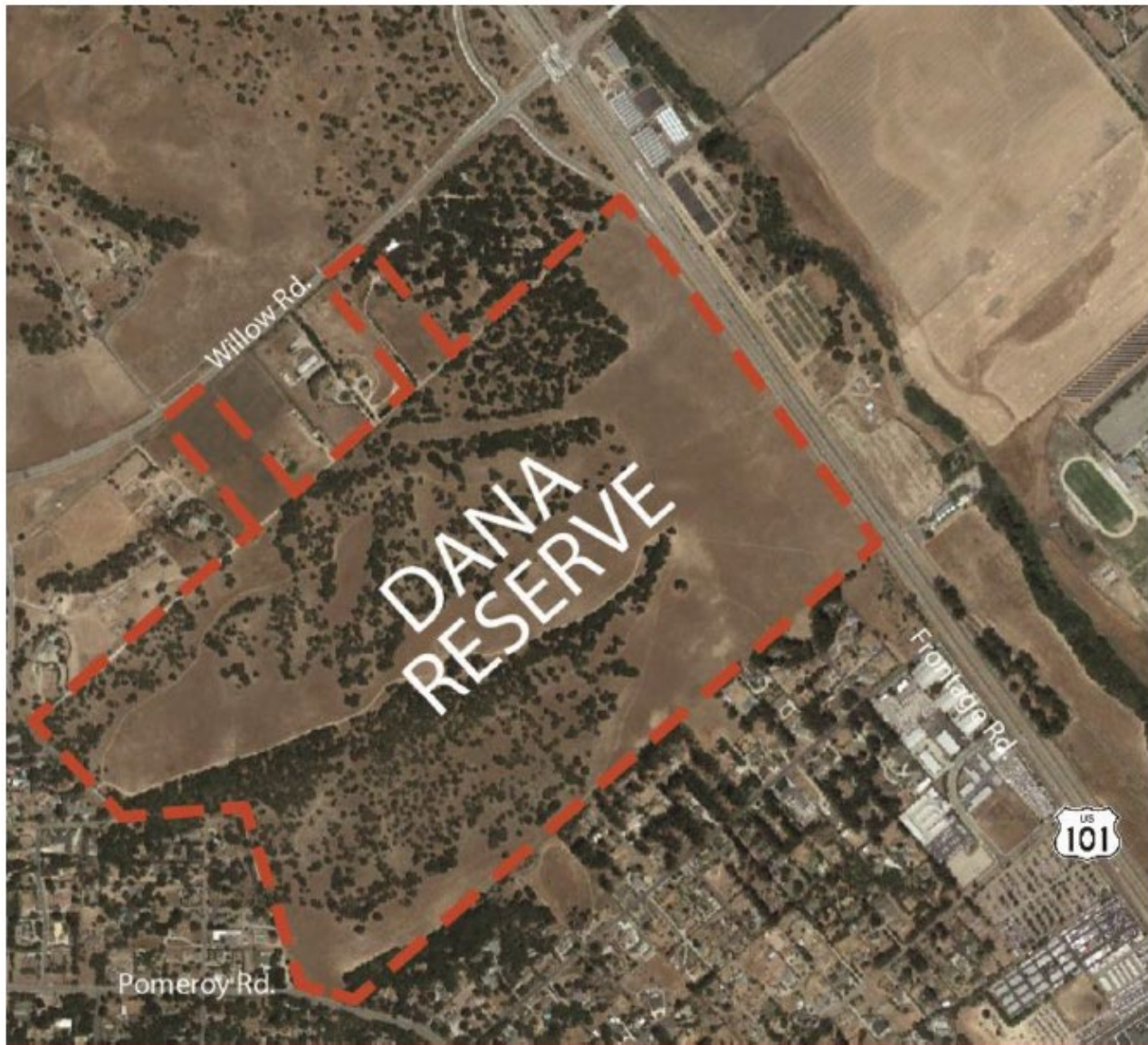
Figure 3. Dana Reserve Specific Plan Area

SECTION 3: The County Board of Supervisors and the County Environmental Coordinator, after completion of the initial study, found that there was substantial evidence in the record that the project may have a significant effect on the environment, and therefore a Final Environmental Impact Report (EIR) was prepared (pursuant to Public Resources Code Section 21000 et seq., and CA Code of Regulations Section 15000 et seq.) for this project. The Final EIR addresses potential impacts on: Aesthetics, Agricultural and Forestry Resources, Air Quality, Biological Resources, Cultural Resources, Energy, Geology and Soils, Greenhouse Gas Emissions, Hazards and Hazardous Materials, Hydrology and Water Quality, Land Use and Planning, Mineral Resources, Noise, Population and Housing, Public Services, Recreation, Transportation, Tribal Cultural Resources, Utilities and Service Systems, and Wildfire. Mitigation measures address these impacts and are included as project conditions of approval. Overriding considerations were determined necessary based on significant and unavoidable impacts associated with Air Quality, Biological