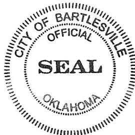
City Clerk (SEAL)