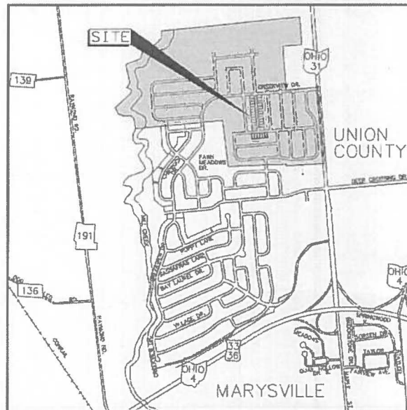
LOCATION MAP SCALE: 1" = 4000'

Copyright Reserved This drawing is the property of Stantec Consulting Services Inc. and is to be used only for the project and location shown on this drawing. The Company is not responsible for any errors or omissions in this drawing. The Company is not responsible for any errors or omissions in this drawing. The Company is not responsible for any errors or omissions in this drawing.