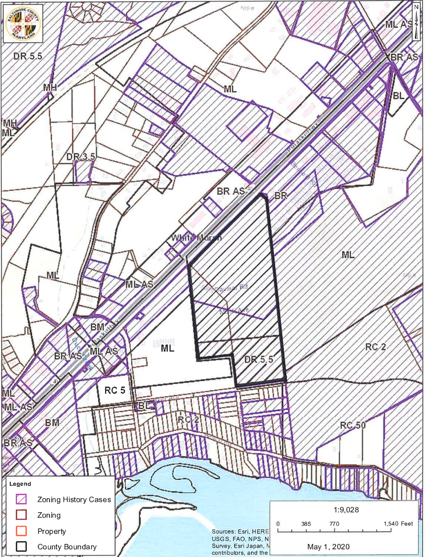
Exhibit "A" Baltimore County - My Neighborhood