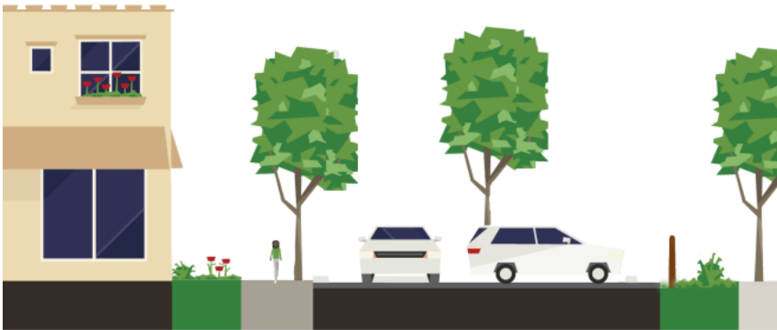
Figure 5. Parking Zone Behind Buildings