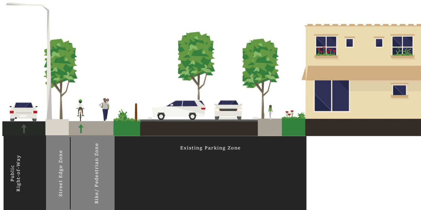
Figure 2. Redevelopment Profile Diagram