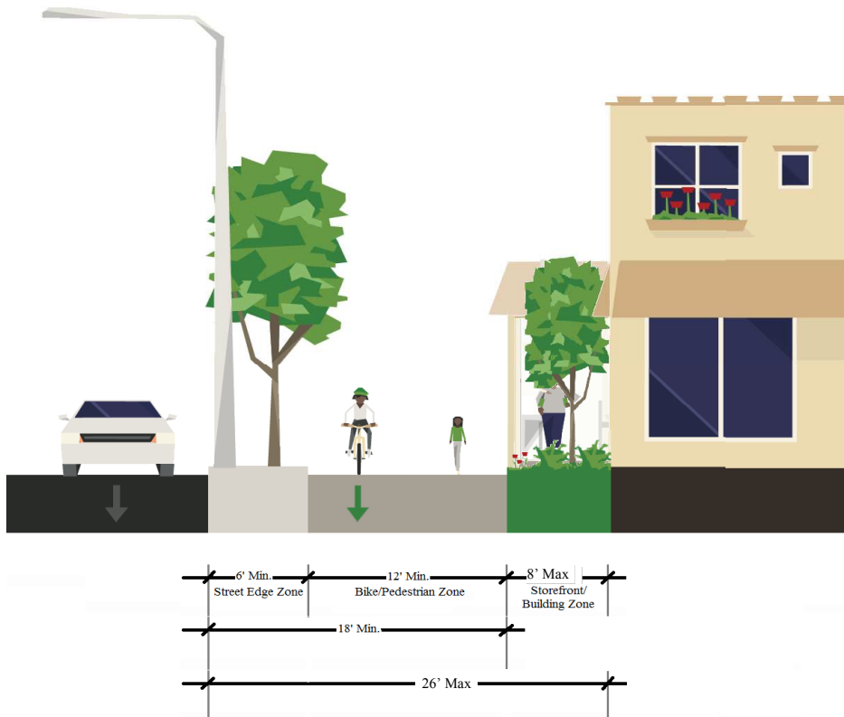
Figure 4. Diagram of Street Edge, Bike/Pedestrian, & Storefront/Building Zones