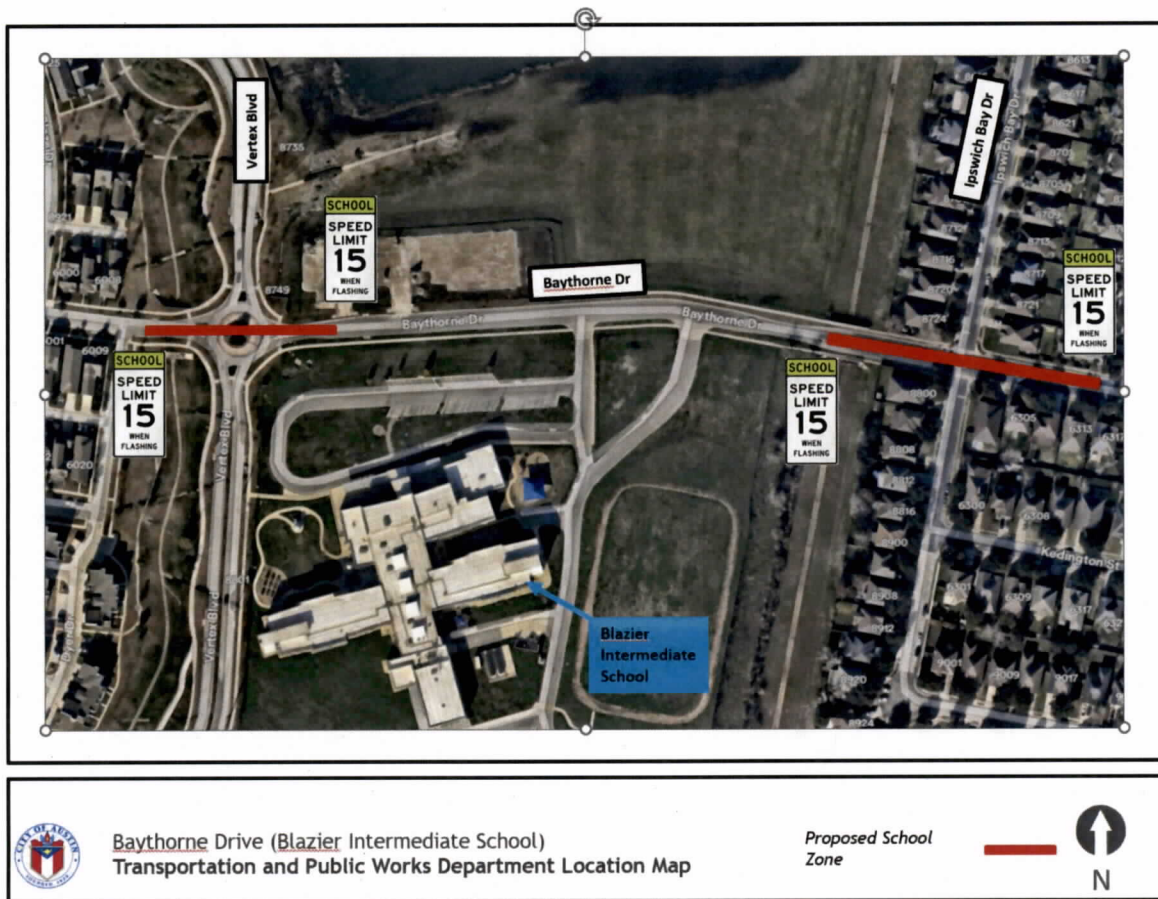
Figure 2: Proposed School Zone on Baythorne Drive