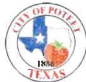
City of Poteet