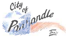
City of Panhandle