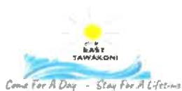
City of East Tawakoni