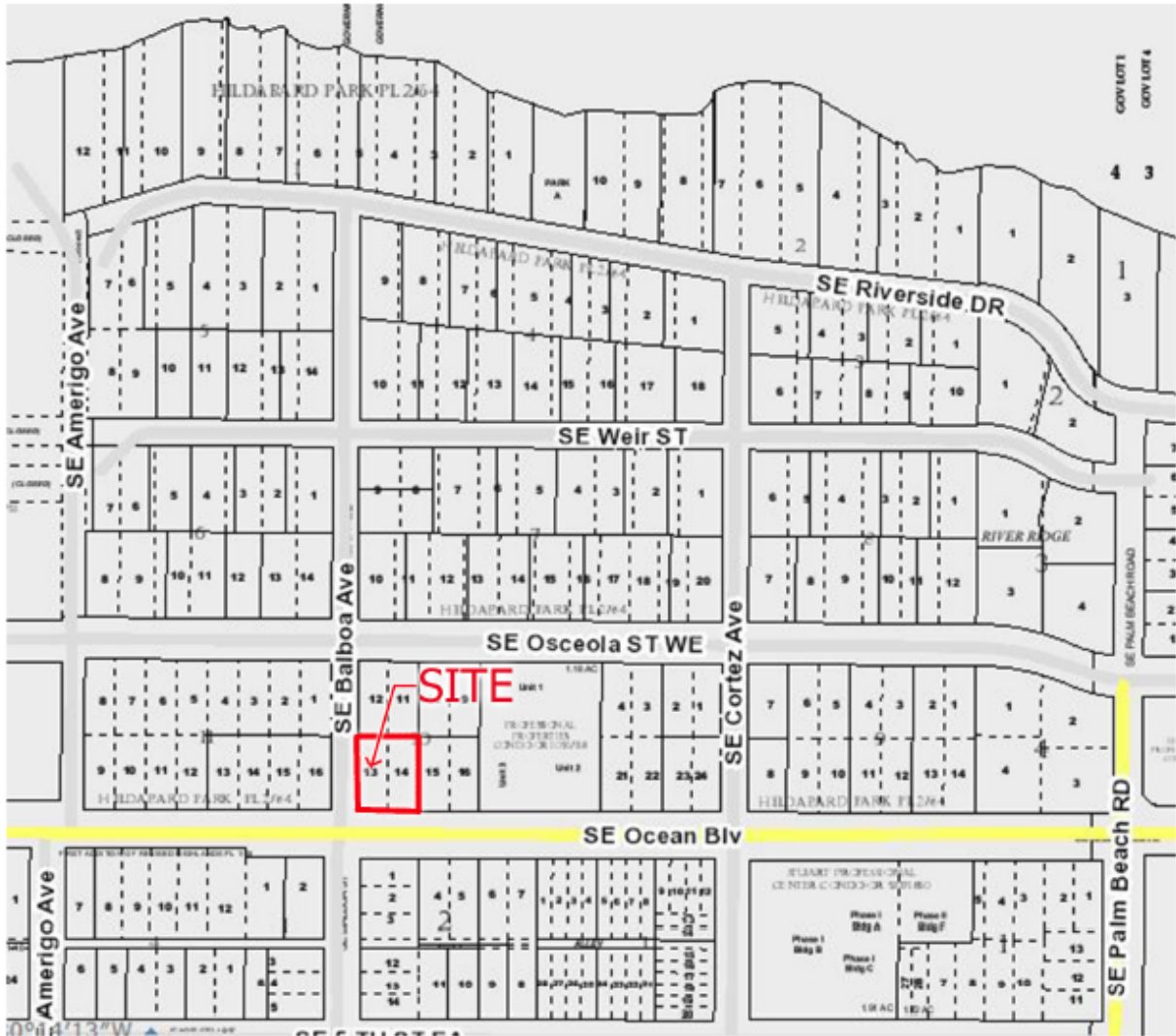
EXHIBIT “C” – DEVELOPMENT CONDITIONS