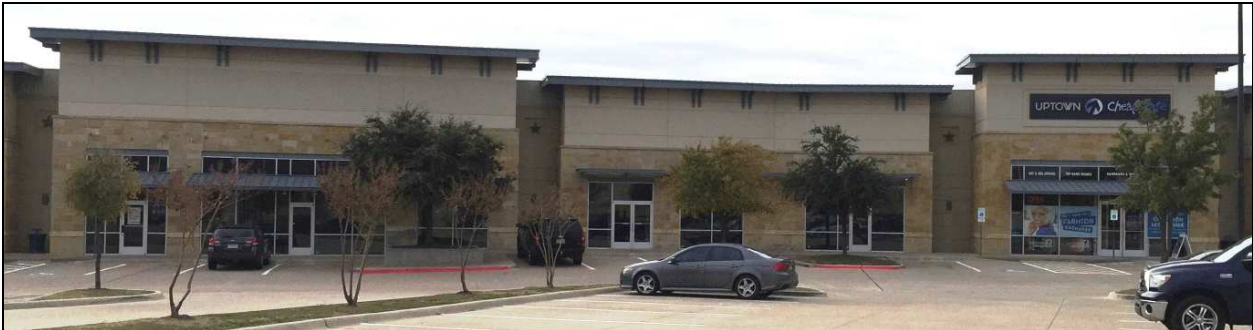
IMAGES 14, 15 16 & 17. Examples of Tripartite Design.