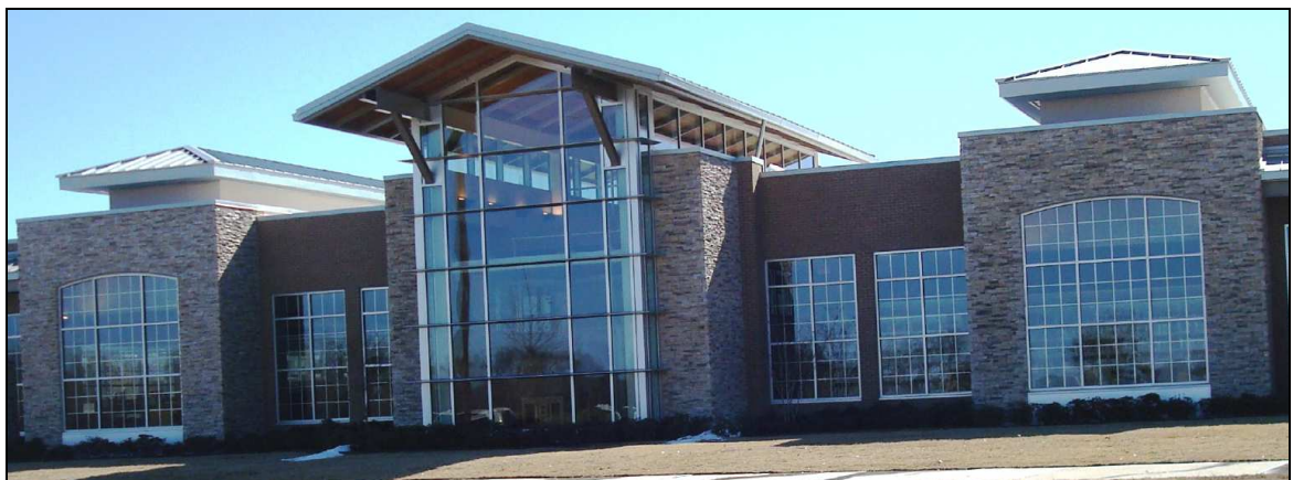
IMAGES 1, 2 & 3. Examples of Appropriate Building Massing.