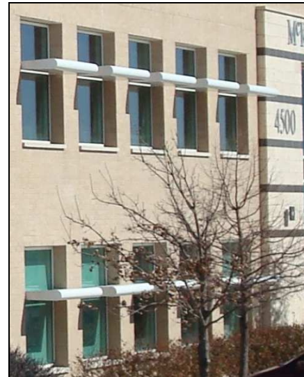
IMAGES 4, 5, 6 & 7. Examples of Appropriate Fenestration.