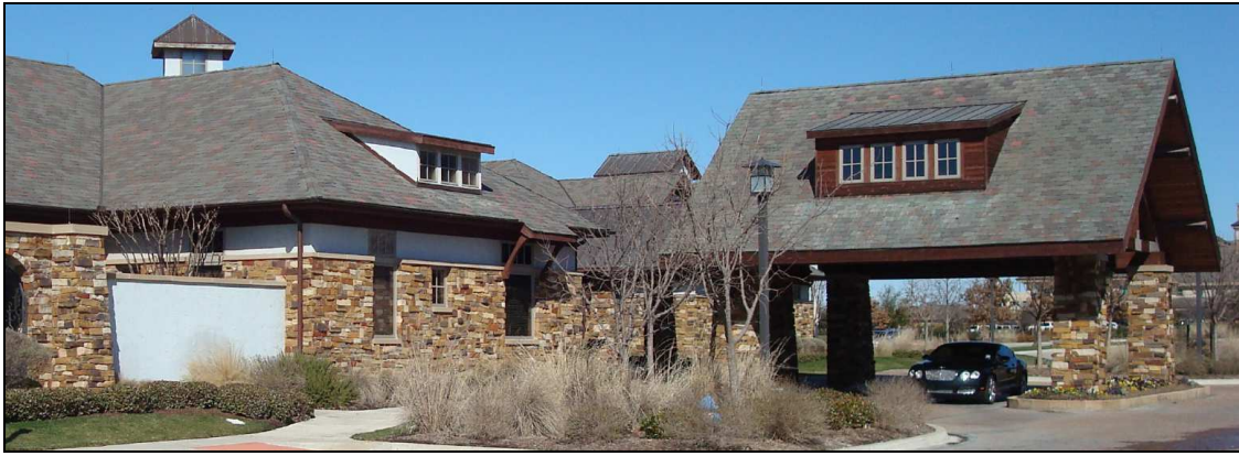
IMAGES 11, 12 & 13. Examples of Appropriate Entry Treatments.