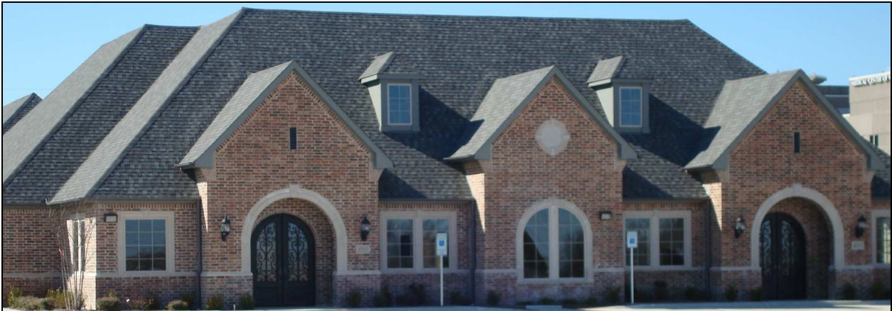
IMAGES 8, 9 & 10. Examples of Appropriate Roof Treatments.