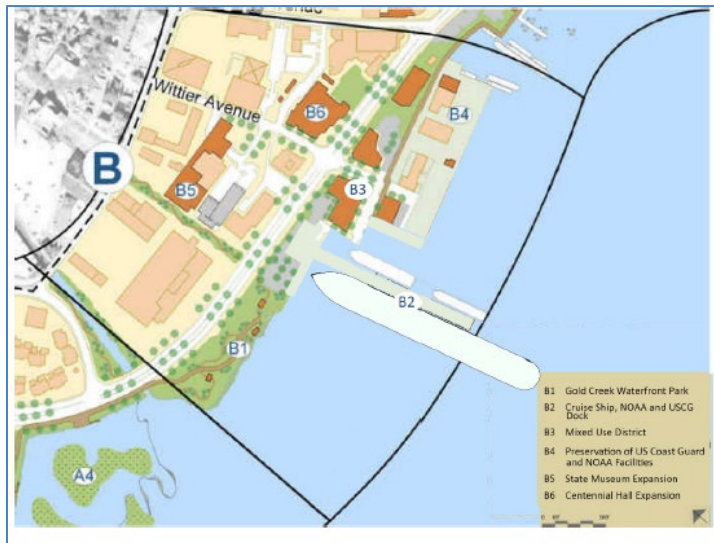
Figure 33: Area B (Overall) 2025 Concept Plan

Page 47. Repeal and replace Figure 33: Area B (Overall) 2025 Concept Plan as follows: