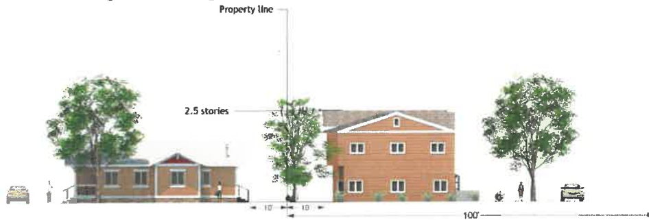
Figure 2: Height Compatibility Flat Roof Example