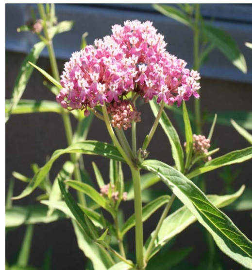
Figure 3. Swamp milkweed ( A. incarnata ).

There is new research indicating that female monarchs may prefer laying eggs on some species over others. In controlled laboratory experiments Ladner and Altizer (2005) showed that monarchs lay more eggs on swamp milkweed than any other species and laid very few eggs on narrow-leaf milkweed with showy milkweed intermediate between the two species (Figure 4). For most artificial monarch butterfly habitat plantings in Idaho, it would be appropriate to plant a mixture of showy and swamp milkweed. For restoration and natural habitat projects, consult the distribution maps in the PLANTS Database to determine which species are native to the site.