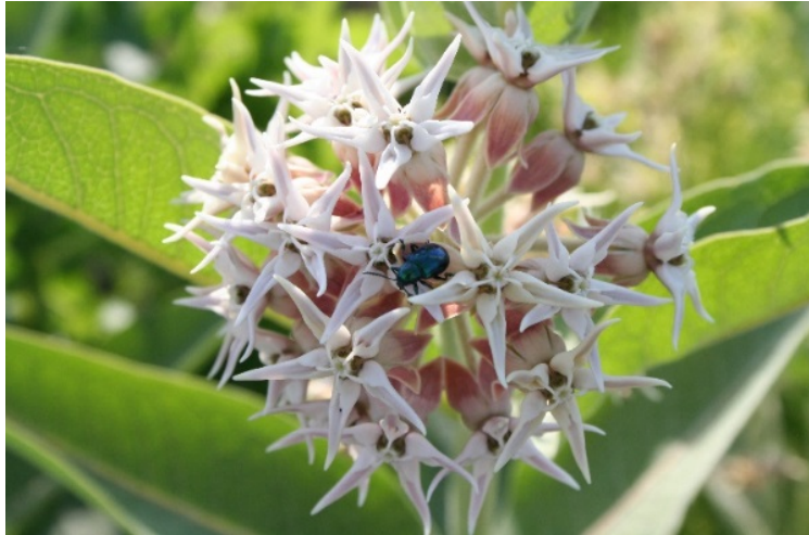
Figure 2. Showy milkweed ( A. speciosa ).

There are several species of milkweed native to Idaho, but two are especially valuable for monarch habitat plantings. Perhaps the most abundant milkweed species in Idaho is showy milkweed ( Asclepias speciosa ) (Figure 2). This species is common along ditch banks and in pastures throughout Idaho, up to elevations of about 6,000 ft. Like all milkweeds, showy milkweed is toxic to livestock, but this species is not known to have caused major problems with grazing animals. Due to its bitter taste and large leaves is much less likely to be accidentally grazed than the narrow-leaved species.