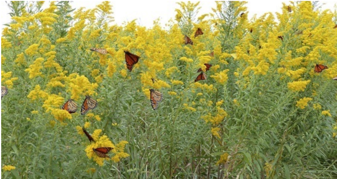
Figure 6. Monarchs foraging on goldenrod, an excellent source of nectar.

Adult monarchs differ from the caterpillars in obvious ways, but maybe not so obvious is the fact that adult monarchs have a completely different diet due to their changed mouth parts. During the metamorphosis from caterpillars to adults, all caterpillars lose their chewing mouthparts that they used to eat milkweed plants and develop a long straw-like feeding proboscis. With only this tube for eating, adults are limited to a very specific food source, nectar. Butterflies travel from flower to flower sucking the nectar that the plants make as a reward for pollination services.