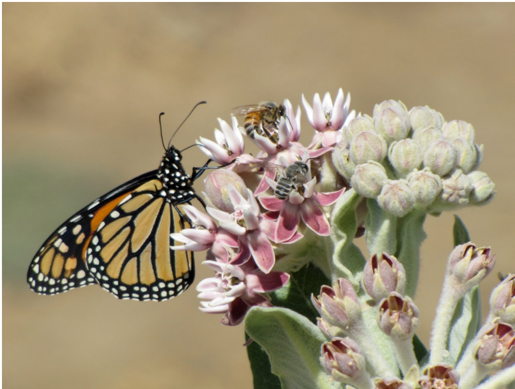
Hedgerow Farms, Winters, CA.