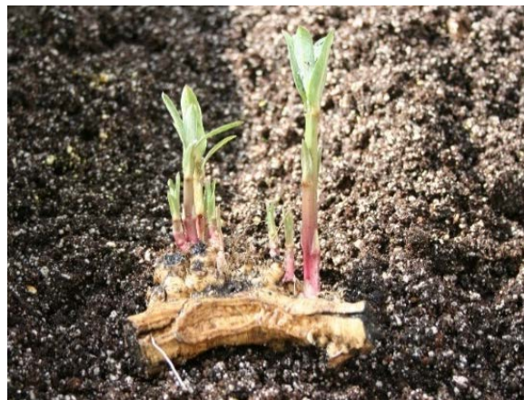
Figure 5. Young milkweeds emerging from a cut section of rhizome.

In addition to seed, milkweeds can be vegetatively propagated using rhizomes, or by transplanting entire plants. Showy milkweed produces a large taproot and rhizomes that may branch to produce multiple plants. These roots can be easily dug up in fall or in early spring before the new shoots have arisen and transplanted (Figure 5). When fall planting, allow enough time for the plants to establish a root system to survive the winter. The roots can be cut into smaller sections as little as 2 inches long, so long as each piece of rhizome has at least one bud. Plant the rhizomes fairly deep, about 4 to 6 inches, to avoid surface drying. Irrigation the first year will improve survival. Both seedlings and cuttings will usually bloom in the second year, although cuttings will occasionally bloom their first year.