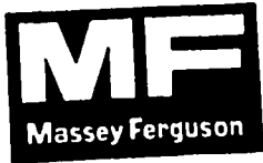
EXHIBIT "D" Watts Brothers Tractor Company

7081 U.S. HIGHWAY 48 PHONE 264-2677 HATTIESBURG, MISSISSIPPI 39402-9815